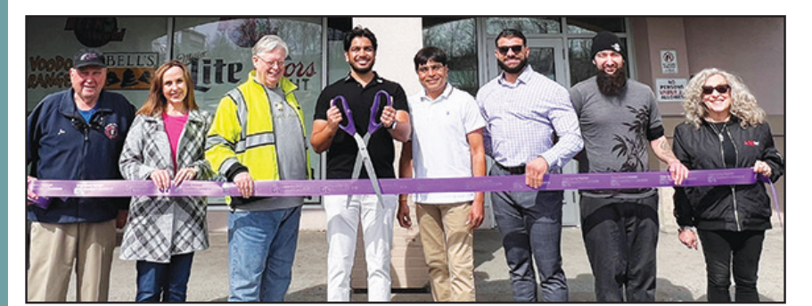
1221 Ulster Avenue, Kingston, NY cannaplanet.com