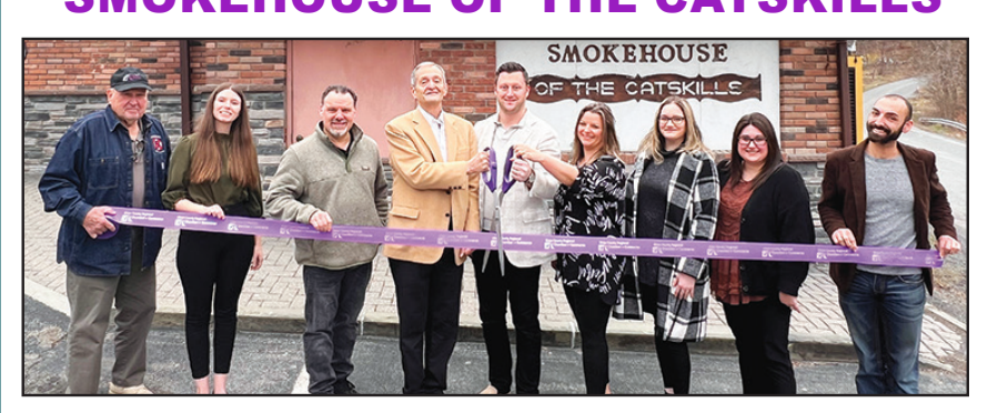
724 NY-212, Saugerties, NY