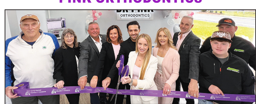
243 Main Street ~ Suite 150, New Paltz, NY drpinkortho.com