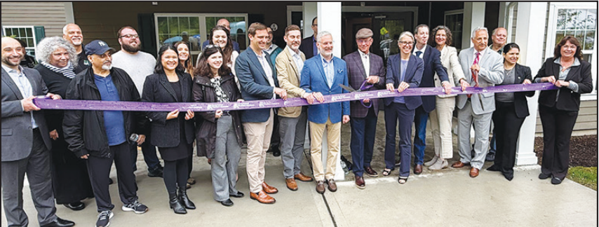
58 Andi Court, Highland, NY rupco.org