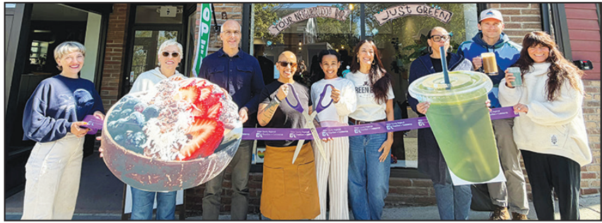
117 Main Street, New Paltz, NY greenbarnp.com