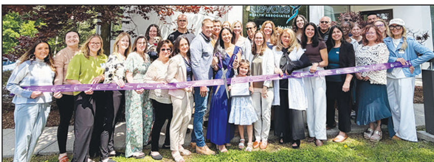
243 Main Street ~ Suite 120, New Paltz, NY elevatehealthnp.com