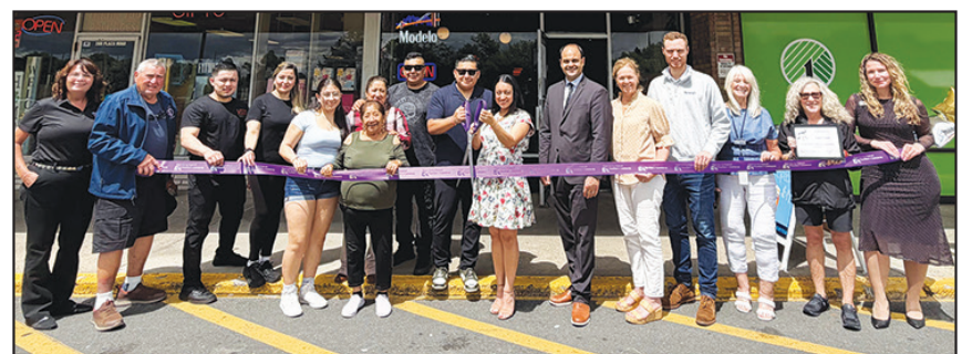
284 Plaza Road, Kingston Plaza, Kingston