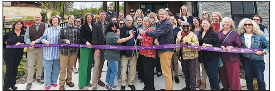
63 Golden Hill Drive, Kingston, NY www.familyofwoodstockinc.org