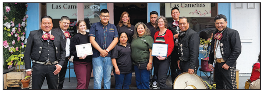
342 Broadway, Kingston, NY