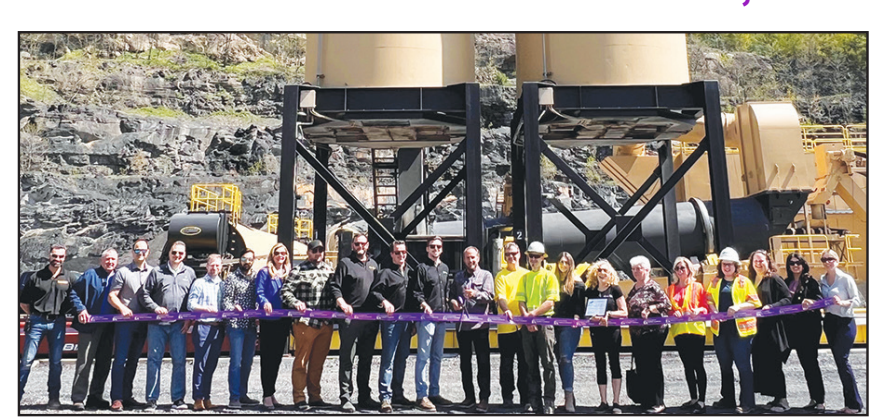
530 Route 28, Kingston NY