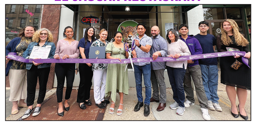
284 Wall Street, Kingston NY