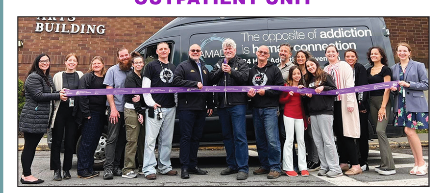
150 Sawkill Road, Kingston NY samadhiny.org