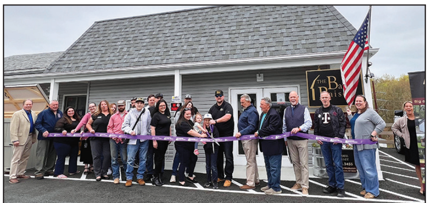
3850 Route 9W, Highland NY www.barnraisersheds.com