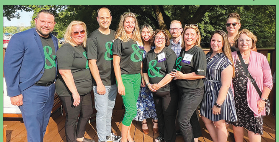
Our Mixer Sponsor the staff from M&T Bank.