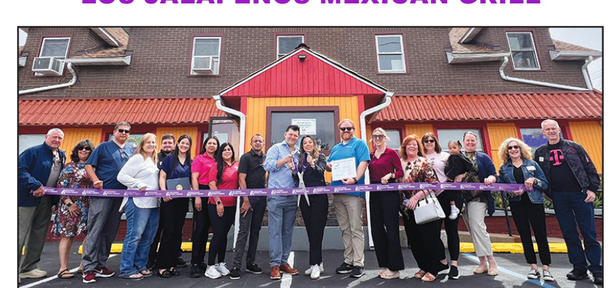
772 Ulster Avenue, Kingston NY