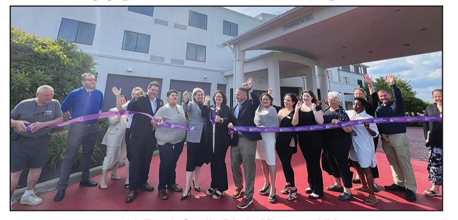
500 Frank Sottile Blvd., Kingston NY www.marriott.com/poucy