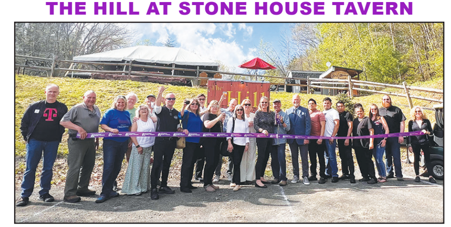
4802 Route 209, Accord NY www.stonehousetavern.net